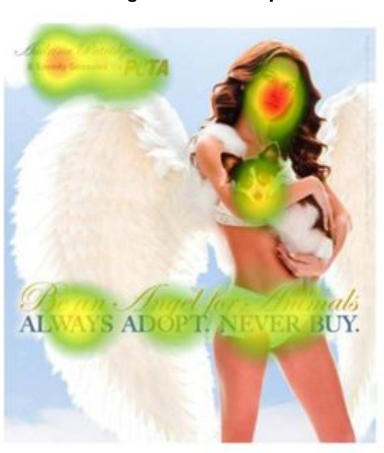
Figure 2 Scan Plots