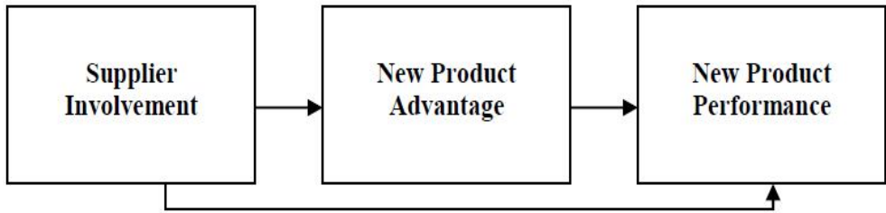
Figure 2: Framework of the Relationship between Supplier Involvement, New Product Advantage and New Product Performance